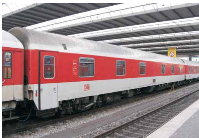
33512 new SOSE 04-2009 DB NachtZug Schlafwagen WLABmz 173.1. 2. Betriebsnummer. Epoche V.