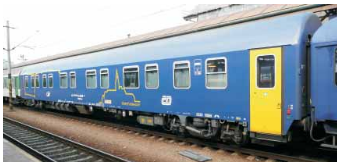
35511 new 05-2009 CD Schlafwagen WLABmz 173.1. Epoche V. Betriebsnummer 61 54 72-91 001- 2 „Praha“.