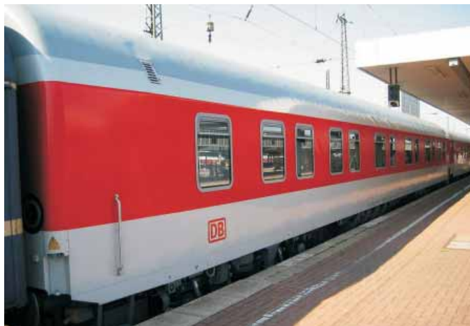
33511 new 04-2009 DB NachtZug Schlafwagen WLABmz 173.1. Epoche V.